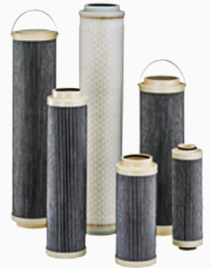
HyPro Filter Elements

The customer required a NAS 6 for all top drives and BOP's repaired as a requirement by the end users. The customer had been unable to attain this level with other filter manufacturers after trying with several brands.